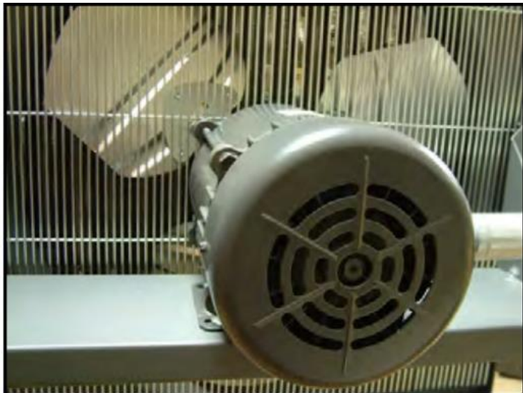
Hazardous Location Rated Motor