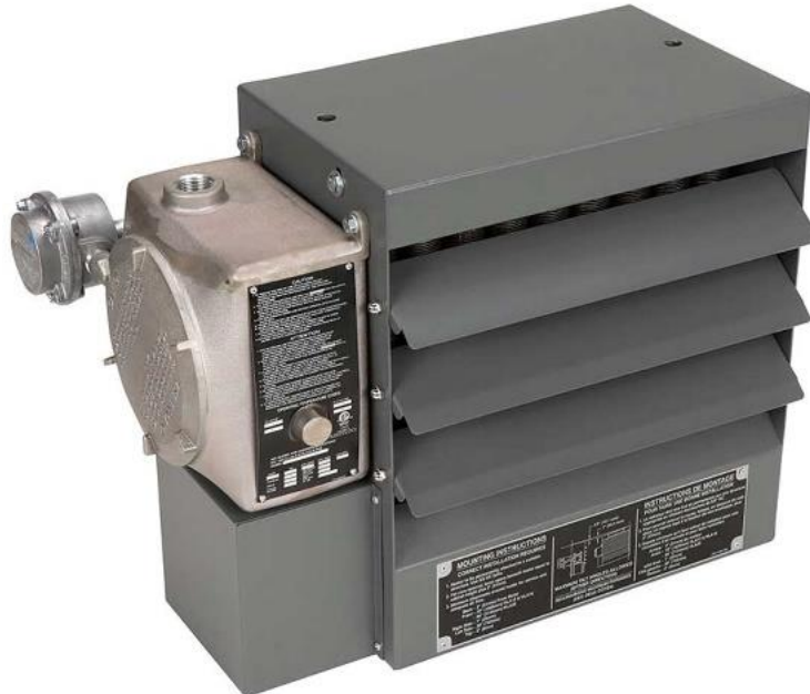
Optional built-in thermostat